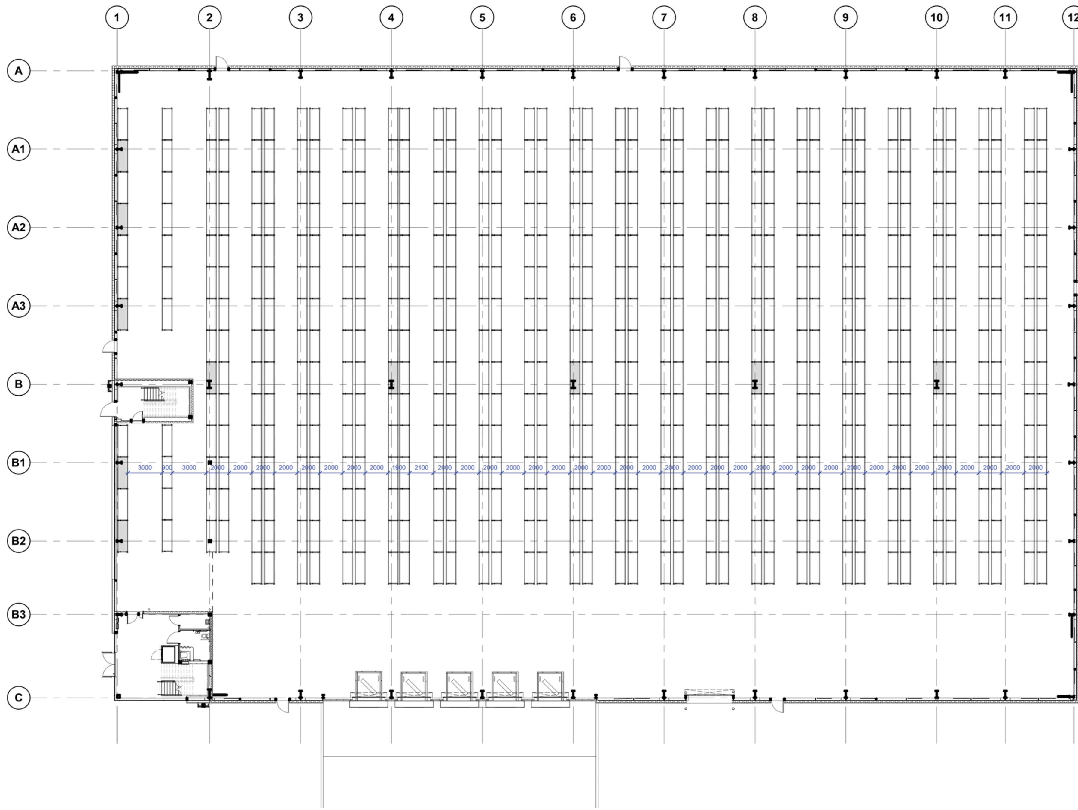
Unit 4 - Racking Plan Layout - Narrow Bay 1 : 200

Notes:- Racking layout may need adjustment to co-ordinate with joints in floor slab. Open bays at floor level may be needed subject to review of escape distances by local Authority Building Control